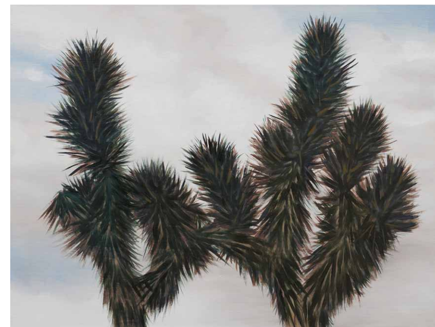
It Looked Different Than I Remembered 2018 Oil Paintings on Linen, birdcage, mixed media, and placecard on artist shelf 31" x 108"