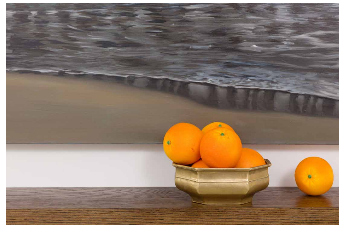
Think/Believe 2018 Oil Paintings on linen, brass bowl, plastic oranges, and artist shelf 32 x 76"