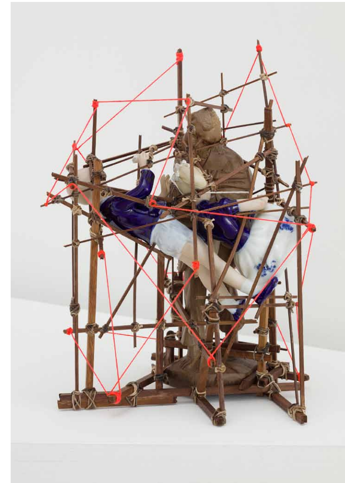
Things That Do Not Sleep and Delivered Every Time 2018 Mixed media 11 x 7 x 13.5"