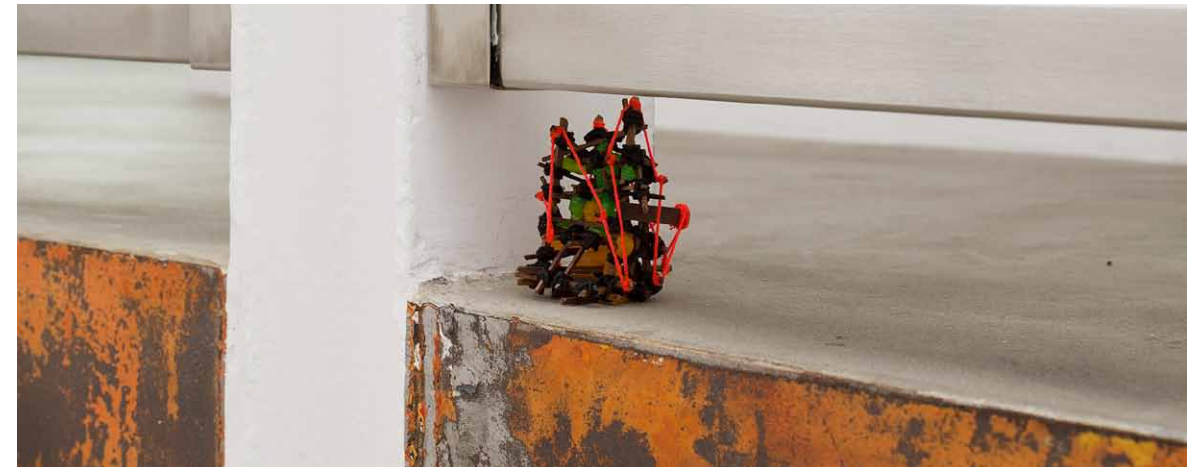
Things That Do Not Sleep and Delivered Every Time 2018 Mixed media 2 x 2 x 3"