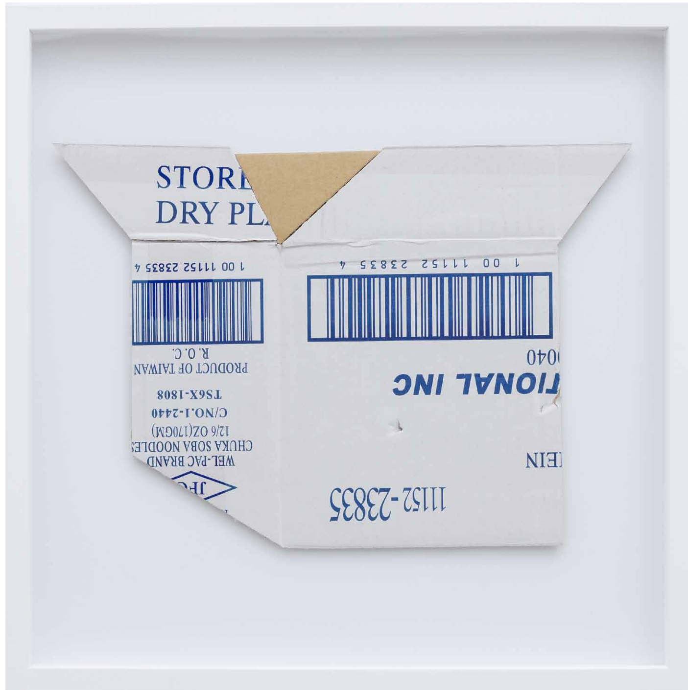
Asian Box 2017 Cardboard boxes 16.5" x 11.5"