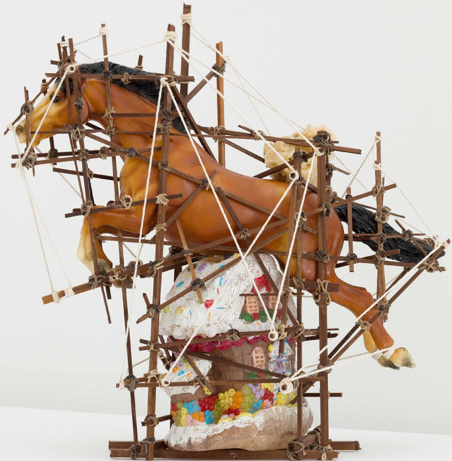
Things That Do Not Sleep and Delivered Every Time 2018 Mixed media 13.5 x 5 x 14"