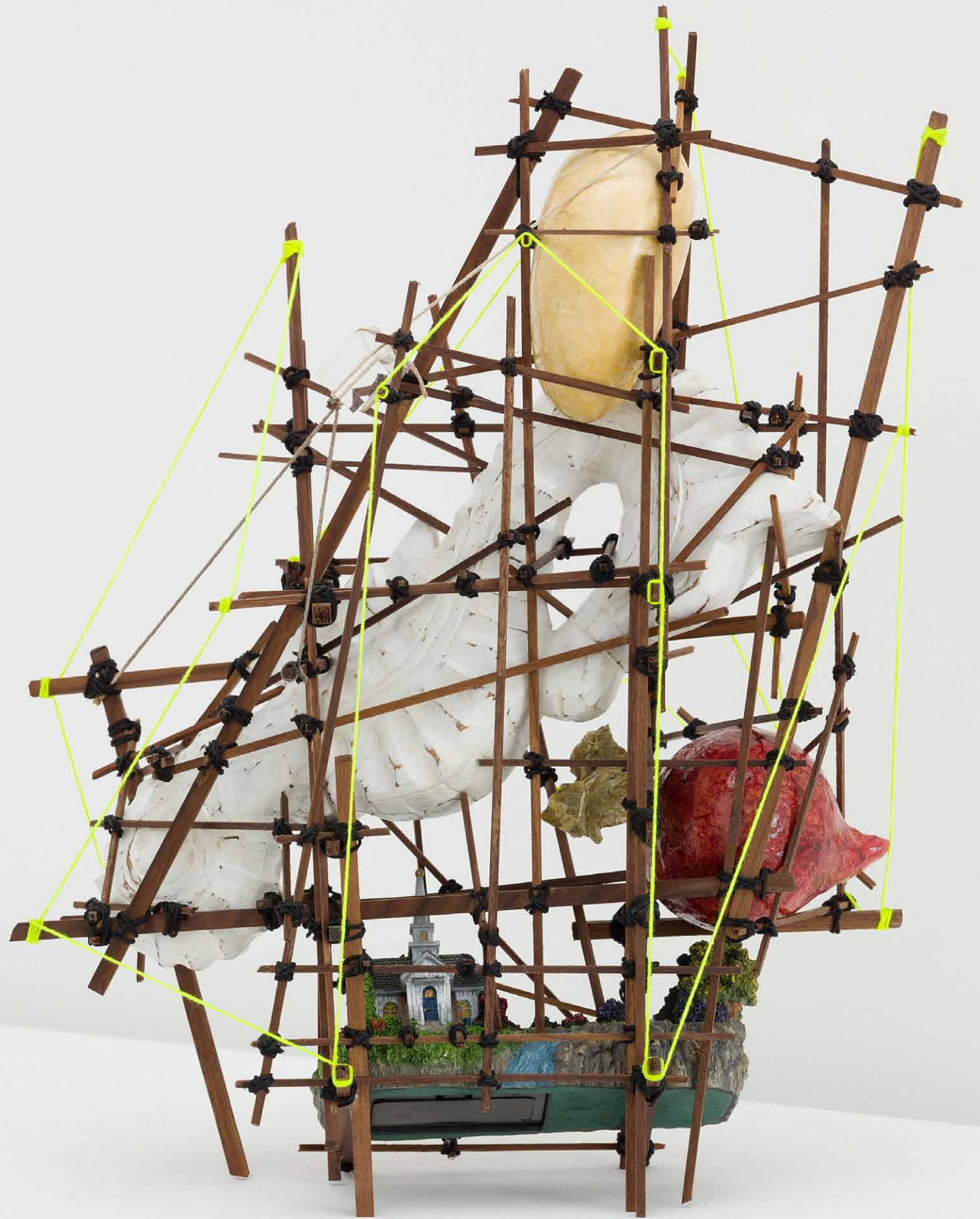
Things That Do Not Sleep and Delivered Every Time 2018 Mixed media 12 x 8.5 x 17"