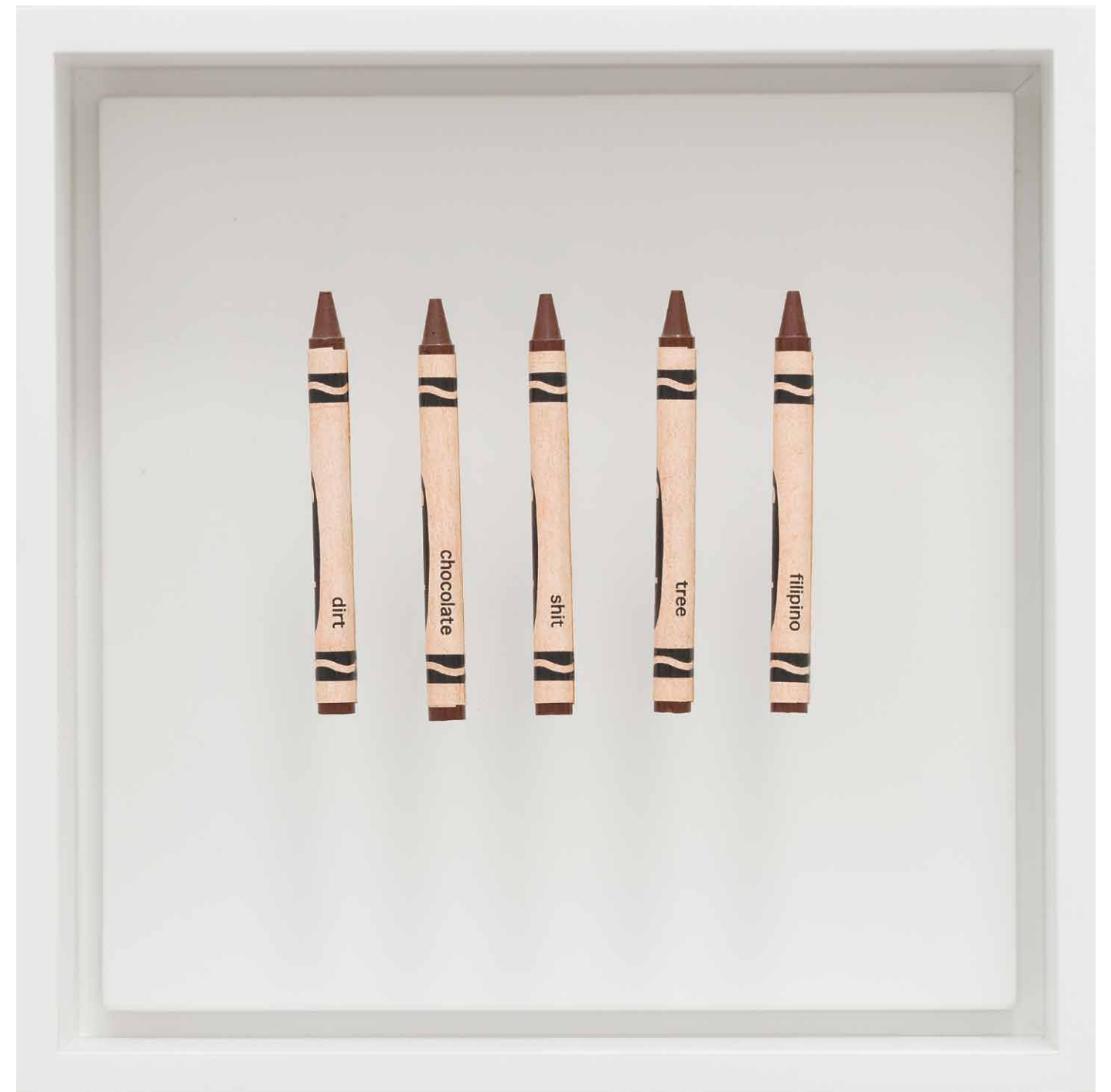
Brown 2004 Crayola crayons, paper, colored pencil 5 @ 3 3/4" x 3/8" NFS (on loan from Nancy Giffin)