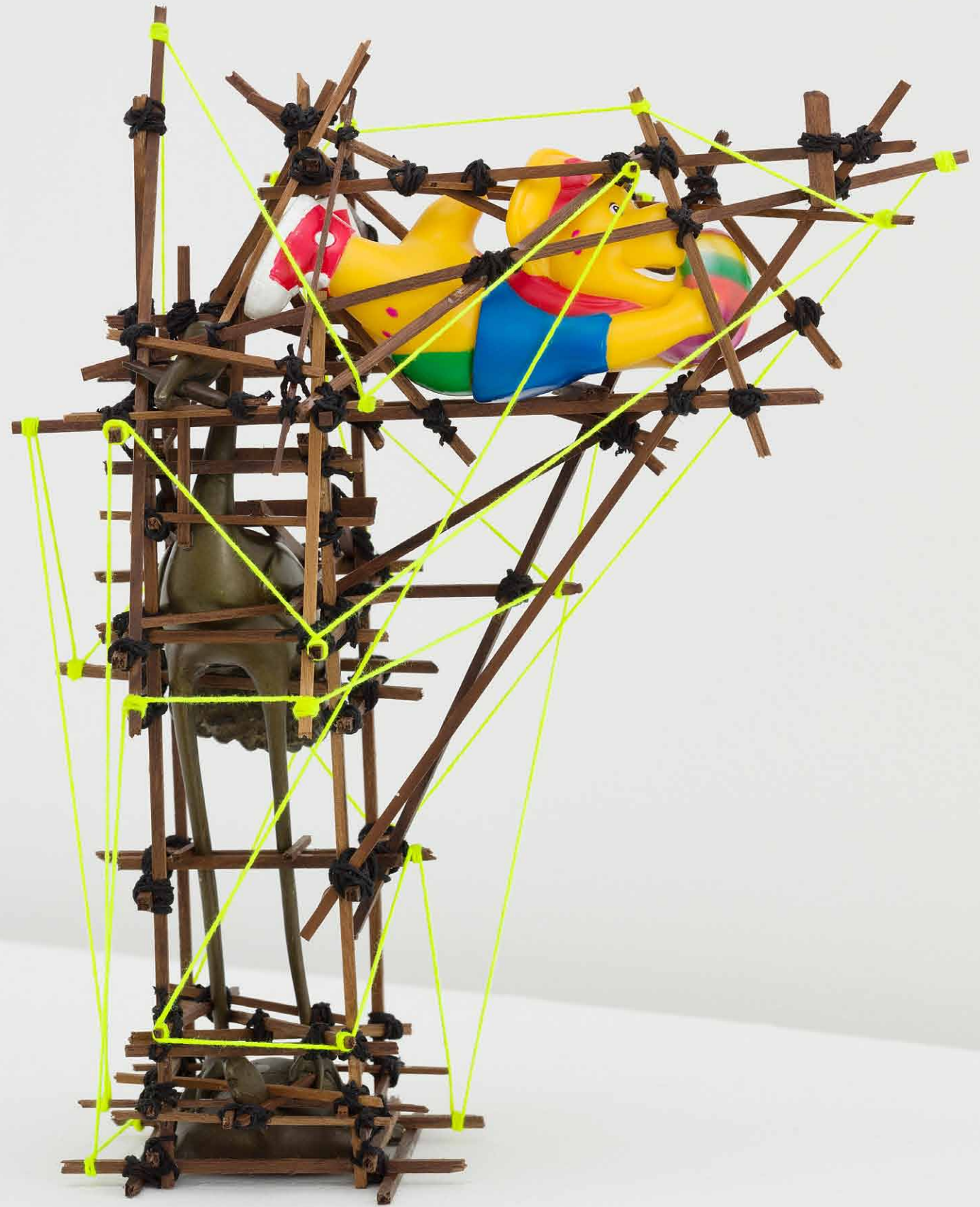
Things That Do Not Sleep and Delivered Every Time 2018 Mixed media 10 x 7 x 12"