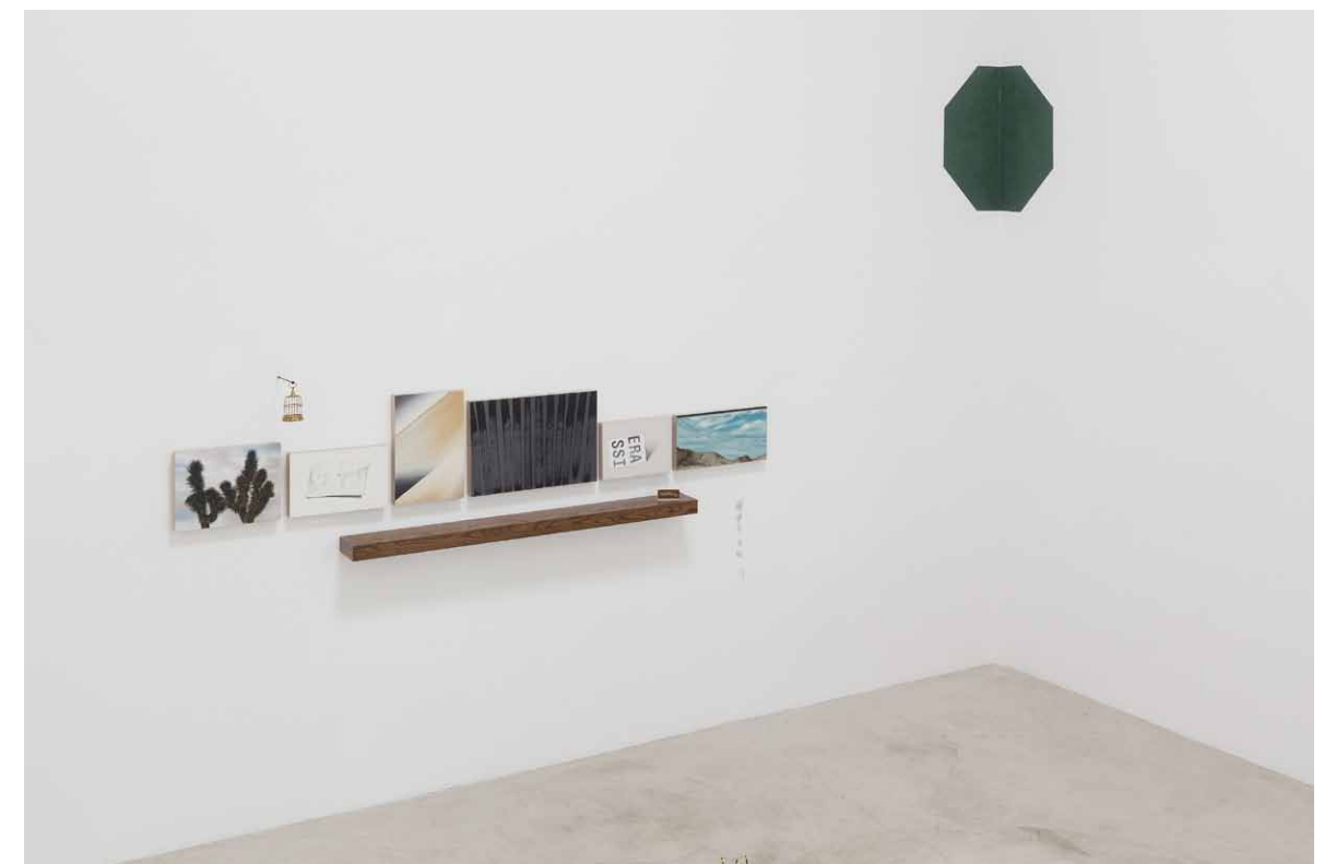
Wall Drawing (second iteration, 2018) Acrylic medium and pigment 30 x 30"